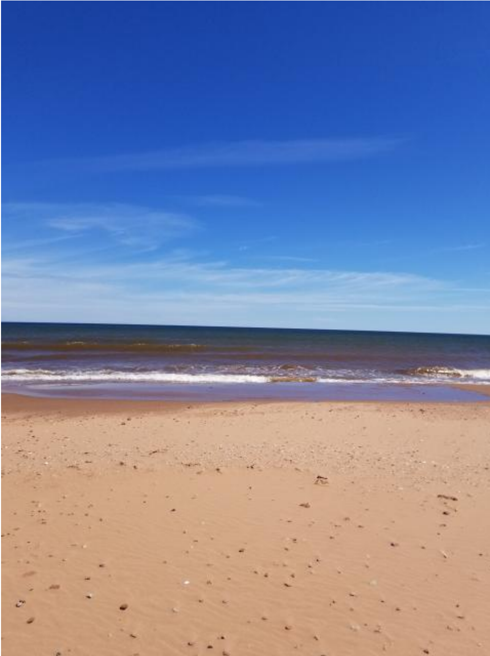
North Shore beach.