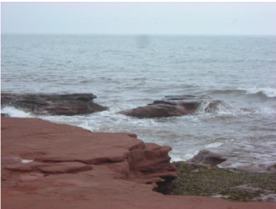
Gulf of Saint Lawrence.

And now, after the ravages of hurricanes Dorian in 2019 and Fiona in 2022, this wildness is intensified. Dorian uprooted thousands of trees across the Island, including many at the Montgomery homesite. Fiona downed countless trees and devastated the sand dunes along the North Shore, meaning that beach access and roads across PEI National Park remained closed for several months after Fiona made landfall. 17 Dorian and Fiona—and even less powerful storms—remind us that nature can be not only soothing, healing, peaceful, and pastoral but also powerful, ruthless, and indiscriminately destructive. The Island is not an idyllic, pastoral landscape. It is,