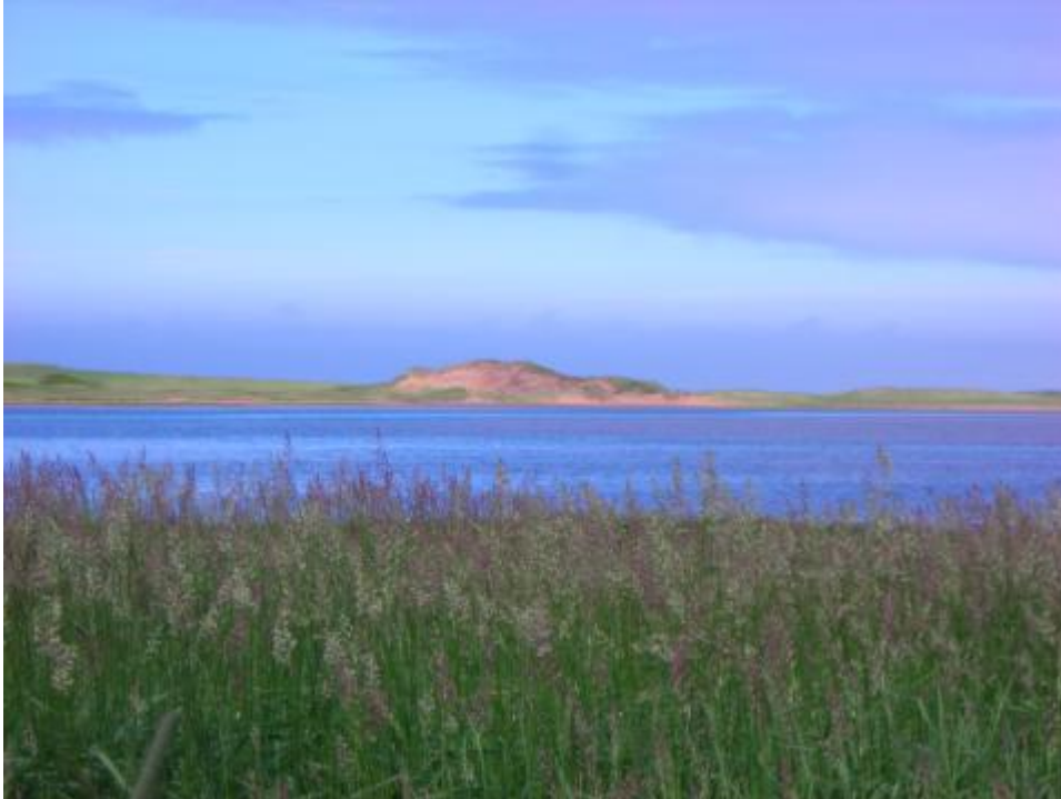
Landscape exemplifying the colours and beauty of Prince Edward Island. Photo by Caroline Jones, 2010.