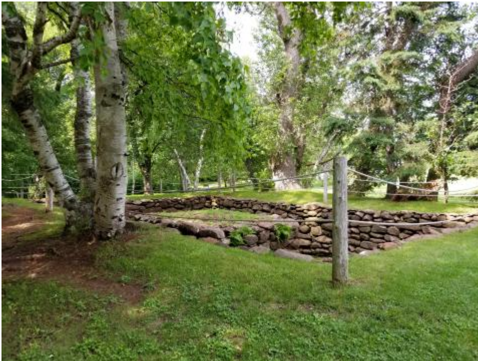
The cellar and foundation of L.M. Montgomery's childhood home in Cavendish, Prince Edward Island. The original kitchen, which had been elsewhere, was returned to the site in late 2018.