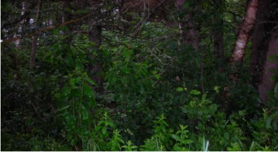
Bedeque woods.