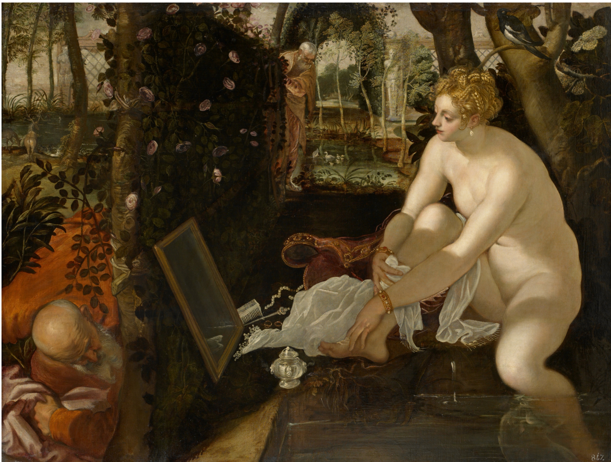
Jacopo Robusti Tintoretto, Susanna and the Elders (1555–1556).

Artworks portraying women often invite the viewer's gaze by including a spectator inside the image itself. 14 In Ways of Seeing , John Berger reflects on two different paintings by Jacopo Tintoretto, both on the biblical subject of "Susannah and the Elders," in which the elders are visible but hidden, watching Susannah bathe. At the same time, Berger points out, we the viewing audience "join the Elders to spy on Susannah." 15