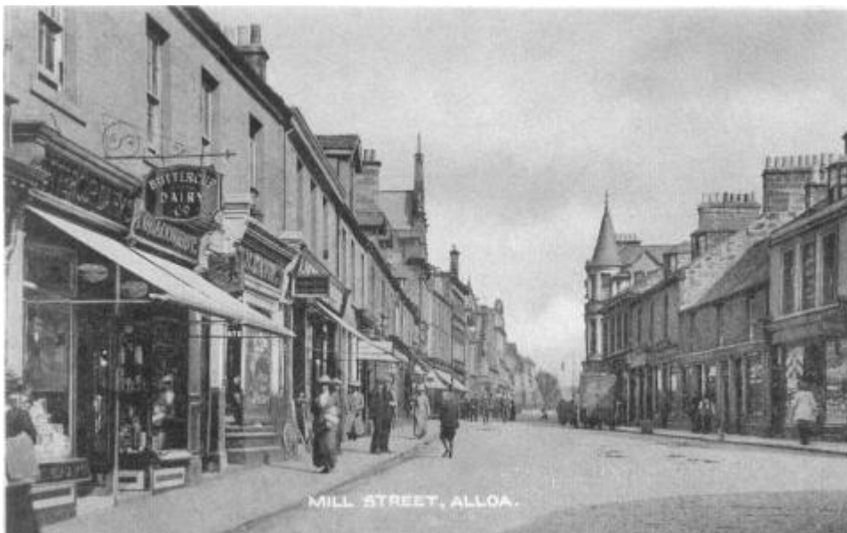
"Mill Street, Alloa Photographs." GENUKI, UK and Ireland Genealogy. genuki.org.uk/big/sct/CLK/Alloa/AlloaPics .