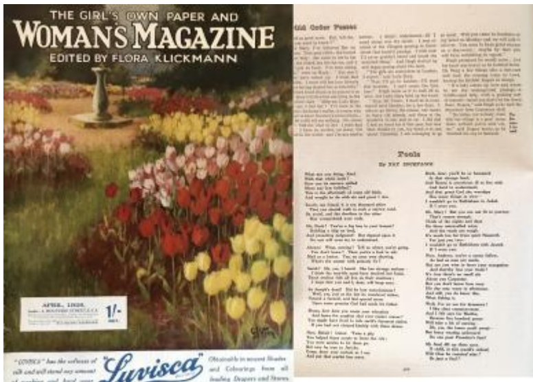
Photo of The Girl's Own Paper and Woman's Magazine , edited by Flora Klickmann, vol. 47, no. 7, April 1926.