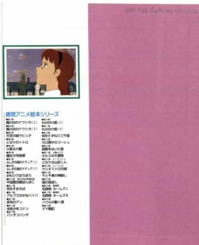
Image of an older Anne in Akage no An . 1979. KindredSpaces.ca , 623 AGG-JapAnime Storybook .

The anime's pacing over fifty twenty-four-minute episodes is part of what allows it to surpass previous film versions of the novel in terms of being a faithful adaptation. 12 Many narrative points must be cut when a book is adapted to a short film or a miniseries such as Sullivan's, which has a total running time of about three hours. While cuts are often unavoidable, they can disrupt the pacing of the source material, lessening the impact of important events, even "in a television series, [in which] there is more time available and therefore less compression of the adapted text is required." 13 Consequently due to its longer running time and prolonged release schedule compared to that of a film, the anime fully uses its potential to portray every chapter of the book in its entirety, as in the Akage no Anne anime in which each episode is devoted to the content of a corresponding chapter in the novel. It also allows for the addition of flashback episodes that flesh out what is only