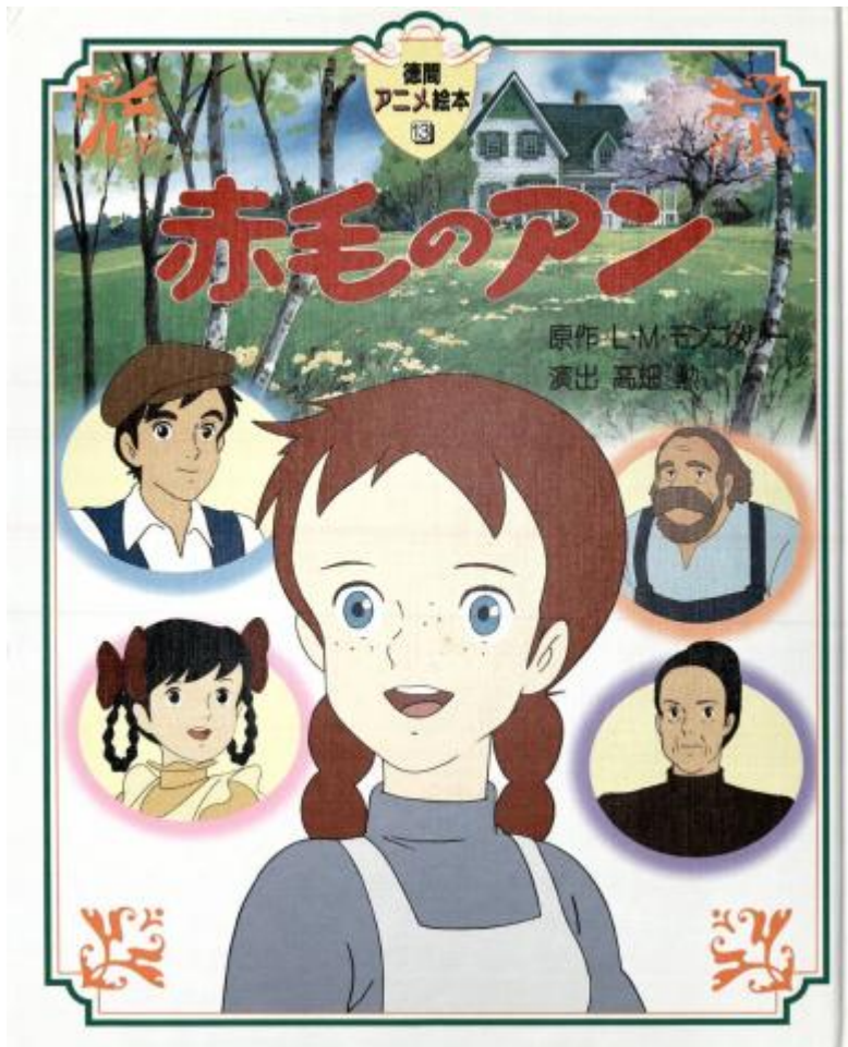
Dust jacket of Akage no An . 1979. KindredSpaces.ca , 623 AGG-JapAnime Storybook.