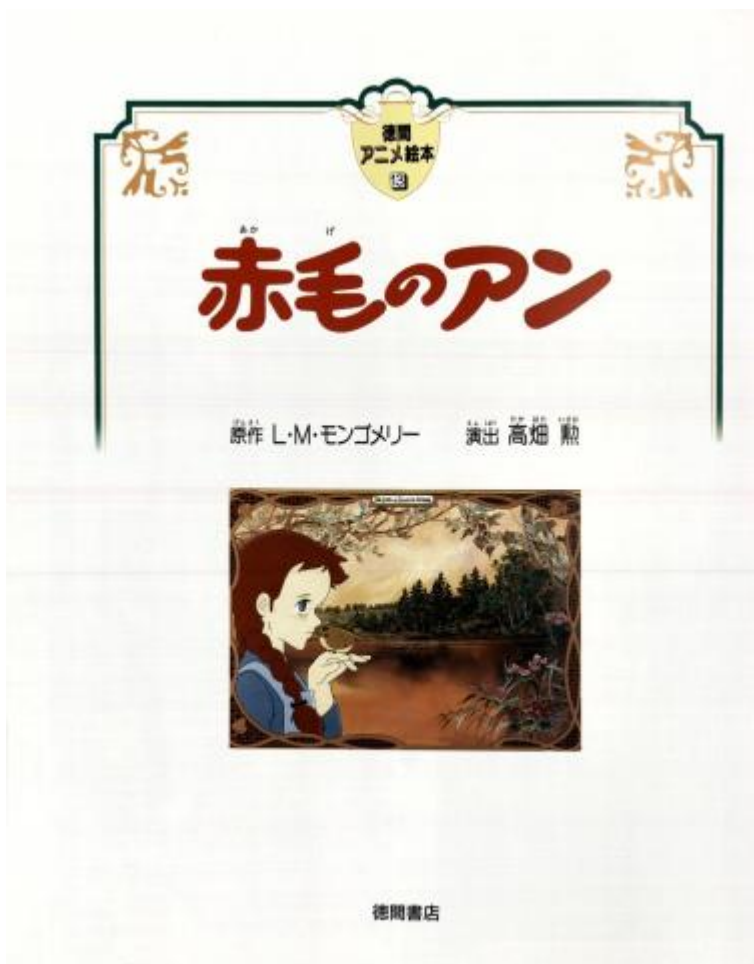
Image from the opening sequence in Akage no An . 1979. KindredSpaces.ca, 623 AGG-JapAnime Storybook .

category of adaptation. These choices reflect Anne of Green Gables's immense popularity with its Japanese audience, this popularity probably being a significant reason for the decision that the anime would be a faithful portrayal of the book's focal themes and values. This paper will then explore how the medium of animation is especially effective in translating Anne's imagination and her coming-of-age character arc. To demonstrate the former, I will explore how the anime is able through the use of visual imagery to deliver organically dream or imagination sequences. In regard to the latter, I will examine the importance of pacing, as this is a key factor in the series' effective portrayal of Montgomery's work since it is able to produce an accurate adaptation throughout the span of fifty episodes, with each episode corresponding to a chapter.